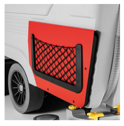
The side elastic net can be used to carry additional cleaning tools that allow to complete the cleaning operations (optional).