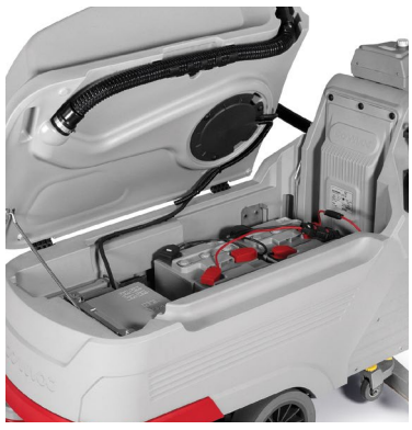
regular and extraordinary maintenance.

The Vega range is equipped with a new digital control panel with an even Full access to components makes easier both clearer and easier to use display to view information and set operating parameters intuitively and quickly. The practical knob on the instrument panel is used to increase or decrease speed according to operating needs. The safety button located under the instrument panel is used to stop the machine immediately in the event of an emergency.